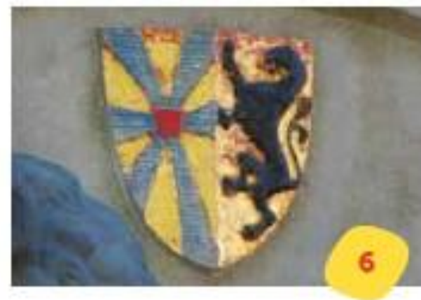
1: VON NEUBURG